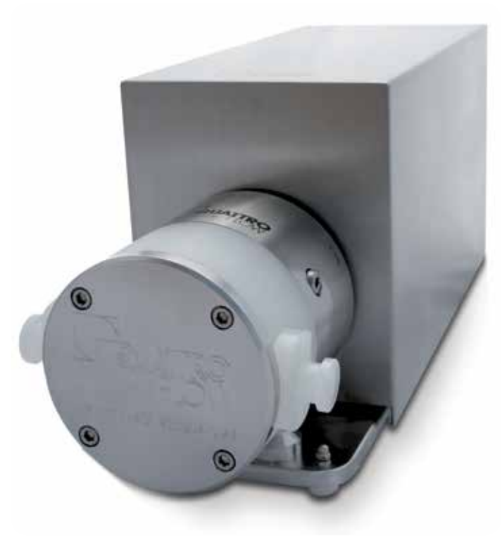
Quattroflow™ QF1200 Single-Use Series Quaternary Diaphragm Pump

The high level of production success that Rentschler has amassed - and the role that Quattroflow pumps have played in it - was acknowledged in 2012 when its 1,000-liter multi-product single-use facility was presented the prestigious Facility of the Year Award in the "Equipment Innovation" category by the International Society for Pharmaceutical Engineering (ISPE), INTERPHEX and Pharmaceutical Processing magazine. The 1,000-liter facility, which features four independent, yet connectable, all-purpose clean rooms, was honored for its ability to minimize manufacturing costs and product cycle times.