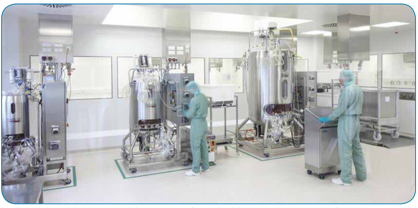
Rentschler Biotechnologie GmbH has built a reputation in the biopharmaceutical-manufacturing industry by becoming what is known as a contract manufacturing organization, or one that specializes in creating products for large conglomerates that need to be manufactured on a smaller scale or within a very short time frame.

In the ultra-competitive world of biopharmaceutical manufacturing, where billions of dollars in sales are constantly at stake, the best friend of large, world-renowned companies like Pfizer, GlaxoSmithKline, Bayer and Roche can often be the contract manufacturing organization (CMO) they choose to do business with. CMOs are frequently called into action when the large conglomerates have a product that needs to be manufactured on a smaller scale or within a very short time frame. In these cases, they may contract with a CMO because partnering with them can be a more cost-effective and faster alternative to producing these smaller-scale pharmaceuticals than using their own production facilities.