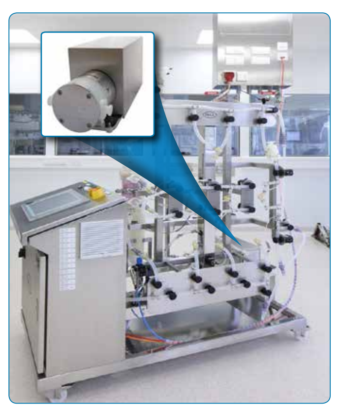
Single-use versions of Quattroflow QF1200 pumps help Rentschler Biotechnologie maximize the speed-to-market capabilities of the biopharmaceuticals that it produces. This is a critical consideration when determining a product's ultimate market value within its patent window.

"The problem for us is we must be really flexible for the customer," said Dr. Laukel. "One day we may be working with Customer A, then the next day Customer B, so you have to be really flexible; there is no standard process for us. That's another reason why the single-use Quattroflow pumps are a good choice for our operations."